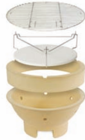
Roasting "Bottom" configuration.