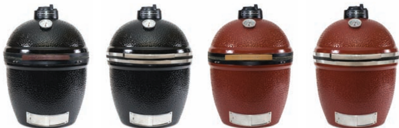
Set of 3 Matching Grill Feet in Black or Red Included

Kamado Joe “Stand Alone” Grills are designed to be used with Kamado Joe Grill Tables or in an outdoor kitchen. They carry the same materials, quality and dimensions as our standard configuration, with the elimination of the side shelves and cart.